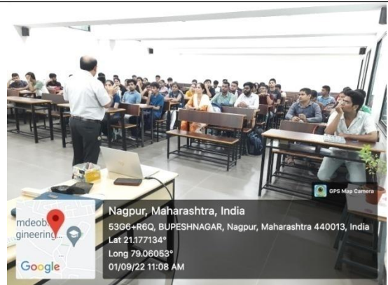
Scope and Role of Electricity in Coal Mine Industry