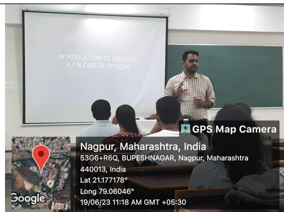
Introduction to Industry 4.0 and Career Options