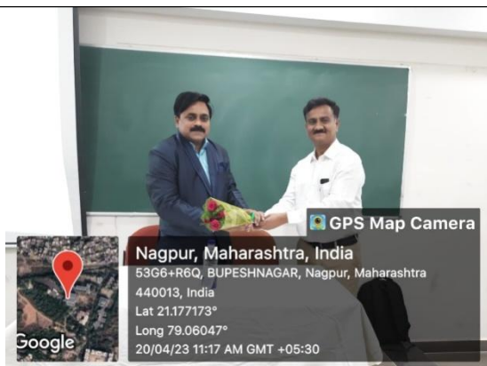
Model Order Reduction Techniques: Fundamental Studies, Applications and Challenges