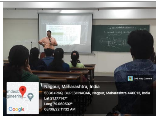
Control and Operation of MMC Voltage Source Converters for HVDC Application