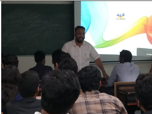
Resume Building and Resume Writing