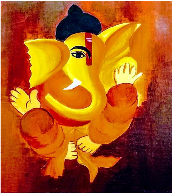
Madhura Deshkar Ec 1 st shift