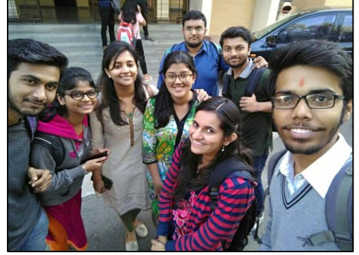
Literary Cup English Debate

Surprise Round – 3 rd Position | 16 January 2018