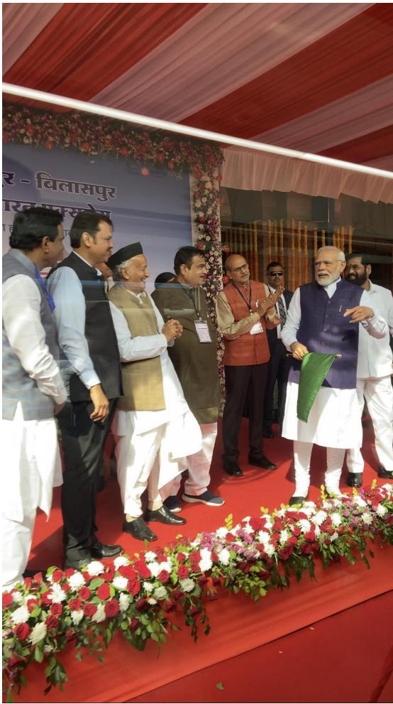
PM Narendra Modi flagging off