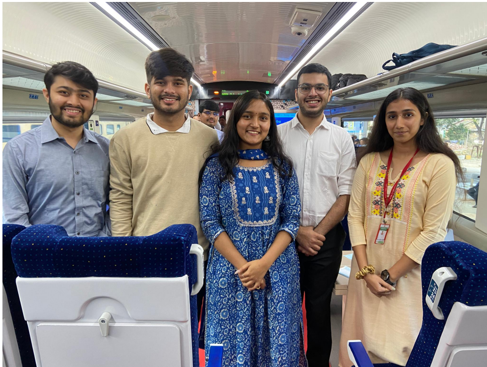
Students in C1 coach