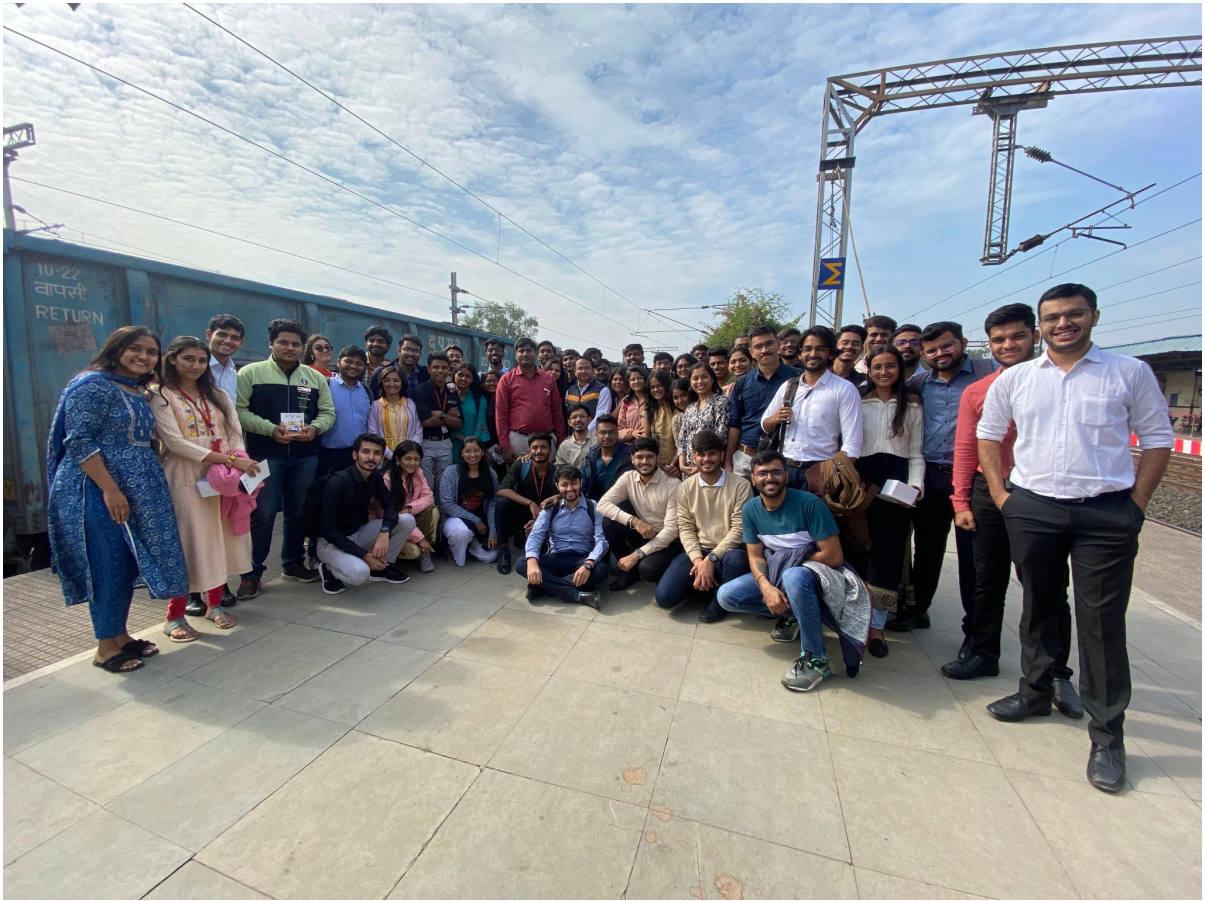
Students at Kamptee Station