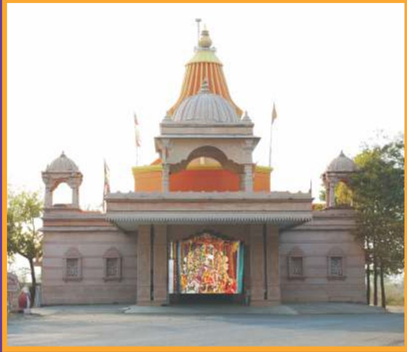
Shri Ramdeobaba Temple on Campus