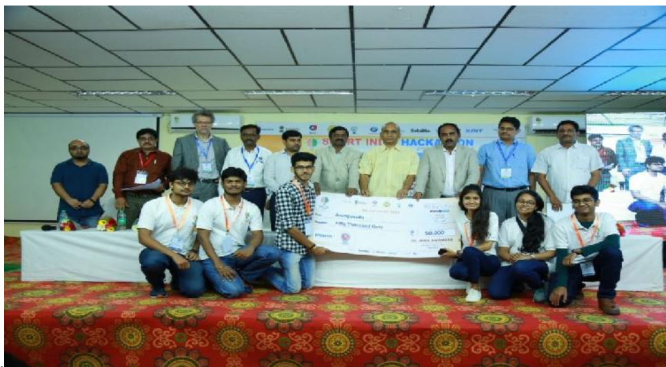
Team AVANGUARDIA emerged Winner of Plezmo Statement at SagiRamakrishnam Raju Engineering College, Bhimavaram, Andhra Pradesh during Smart India Hackathon 2019

03 Teams of Shri Ramdeobaba College of Engineering Management belonging to Department of Computer Science & Engineering emerged WINNERS at the Grand Finale of Smart India Hackathon 2019. All the WINNING Teams successfully solved the problems of “ Complicated ” category to bag cash prize of INR 75,000.00 each.