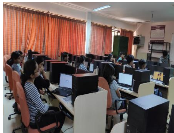
Workshop on Augmented Reality (AR) held on 14 th May 2019