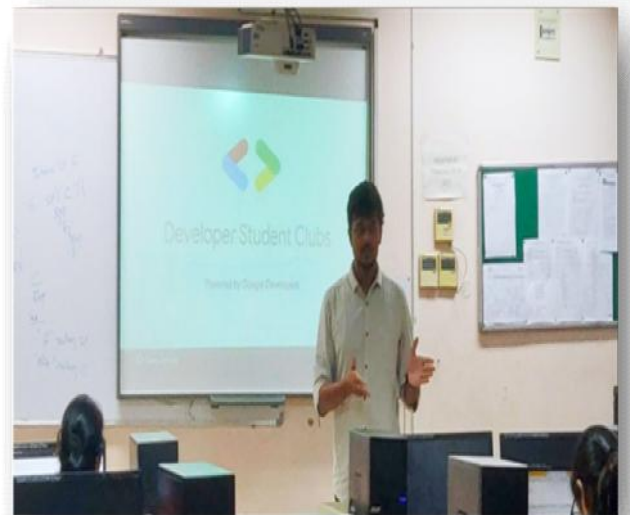
Workshop on “Cloud technology” Organized under RCOEM ACM student Chapter