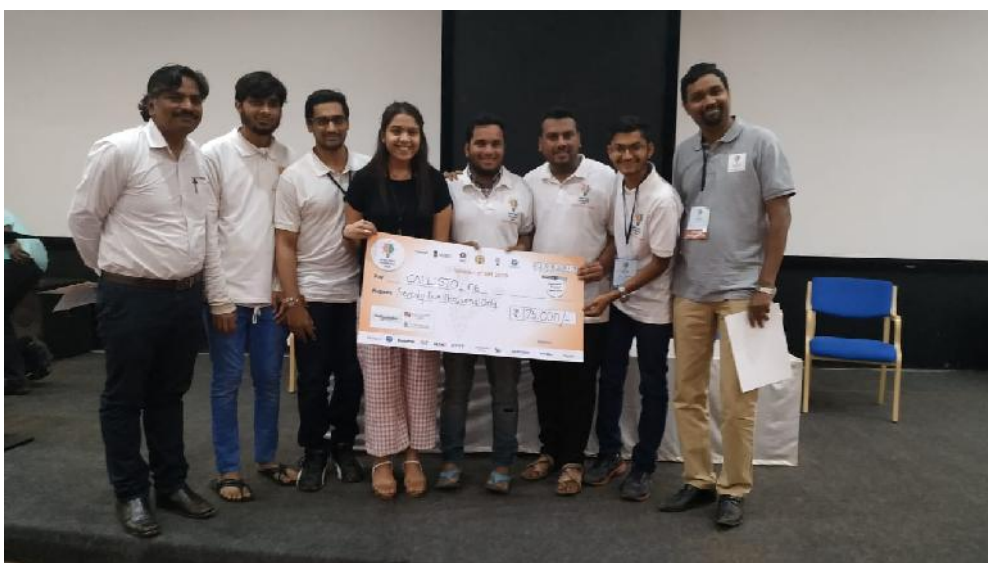
Team CALLISTO_06 emerged Winner of Schneider Electric Statement at B. V. Bhoomaraddi College of Engineering & Technology, Hubli, Karnataka during Smart India Hackathon 2019