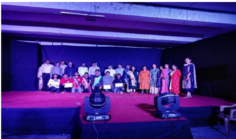
CSE Department Cultural evening at MANZAR 2k19 organized by "Compusys" Society

The Final Round of Eminence (Personality Contest) was conducted. Compusys Student Society conducted various competitive rounds for Mr. and Miss Eminence 2019.