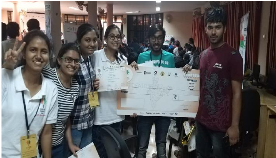
Team IDEATORS_22 emerged Winner of Infosys Statement at National Institute Technology, Calicut, Kerala during Smart India Hackathon 2019